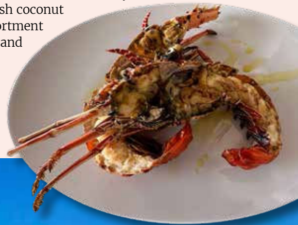
Clockwise from top left | The Iguana, Grilled Lobster, Latitude Restaurant and Bar

irresistible homemade chocolate chip cookies and vegan Ferrero Rocher, replenished daily. An espresso machine and a selection of Organic Republic of Teas were at our disposal, along with a welcome amenity of champagne, fresh coconut water, and an assortment of cold cuts, nuts, and dried fruit. >>